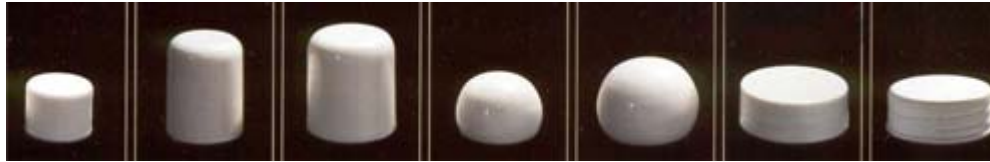
SC/SR-18/410 SC/SR-20/410 SC/SR-24/410 SC/SB-20/410 SC/SB-24/410 SC/SR-33/410-2 SC/SR-33/410-2