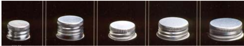
SC/ALS-20 SC/ALS-24 SC/ALS-P-24 SC/ALP-28 SC/ALP-33